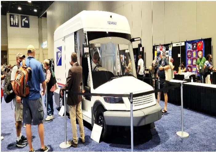
Front end view of NGDV prototype