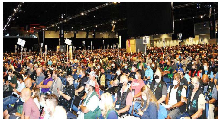
Convention Floor – Chicago 2022 – 4000+ Delegates

NOTE: It's not too early to plan on attending the 2024 NALC National Convention. It is scheduled to take place in Boston, Massachusetts in August 2024. Actual date not yet announced.