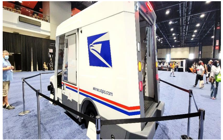
Rear end view of NGDV prototype