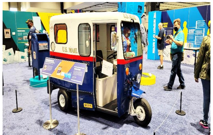
Postal " Mailster " – This is what the Post Office considered the NGDV of the 1950's.

Can you imagine having to deliver your route in the vehicle shown above? Well, that's exactly what letter carriers had to do in the 1950's and 1960's. The Westcoaster Mailster, as it was known, was a small three-wheeled vehicle used for mail delivery. It could haul 500 pounds of mail, including large parcels, as opposed to the foot carrier, who had a 35 pound limit. At one point, one-third of all delivery vehicles the Post Office used were Mailsters. The number of Mailsters in use peaked at 17,700 in 1966. Also referred to as mail scooters, Mailsters worked best on flat terrain and in warm climates. Mailsters safely got up to 35 miles per hour from a two cylinder engine. Unfortunately, only three inches of snow could render the vehicle useless. Also, rounding a corner too quickly would cause it to tip over. Prone to breakdowns, where have we seen that? Mailsters were eventually replaced with postal jeeps, which were considerably more reliable.